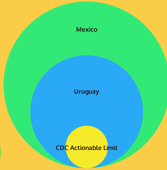
Mean Blood Lead Levels (mg/kg)

URUGUAY Mean soil lead: 2559 mg/kg Mean blood lead: 13.3