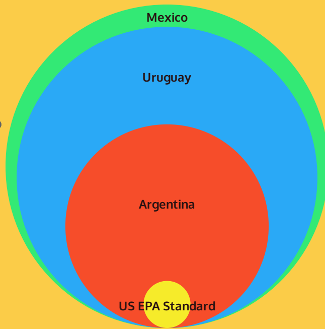
Mean Soil Lead Levels (mg/kg)

ARGENTINA Mean soil lead: 1730 mg/kg Mean blood lead: N/A