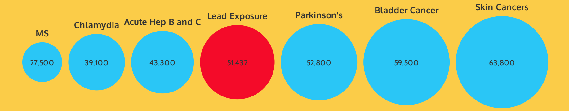
DALY Comparison by Selected Health Outcomes in Argentina, Mexico and Uruguay

DATA COLLECTED AS PART OF PURE EARTH'S TOXIC SITES IDENTIFICATION PROGRAM • RESULTS BASED OFF APPROXIMATELY 316,000 PERSONS AT 129 UNIQUE SITES PUBLISHED BY CARAVANOS ET AL. IN ENVIRONMENTAL HEALTH • JUNE 2016